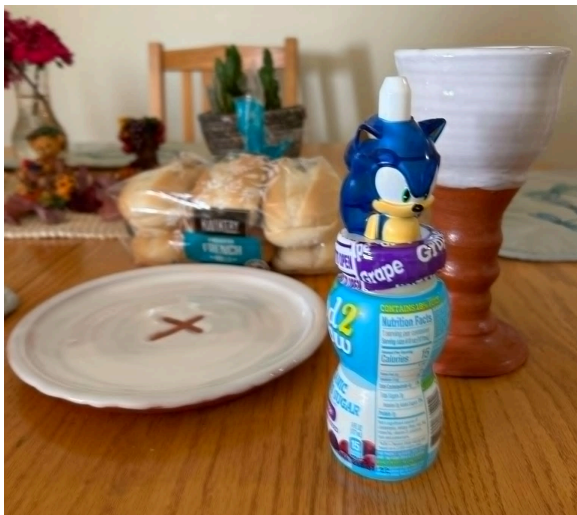
Communion bread and juice at Arlene's home.

Clear Lake Christmas Cookie and Stuffed Baked Potato Sale: Friday, December 13th from 3:30-6:30 pm-- All church family members please donate 6 dozen Christmas Cookies. Workers needed, watch for sign up sheets at the back of the church or contact Debi Ahrens at 715-441-5477.